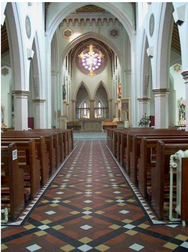
Figure 8: Models/Architecture, Columns and arches