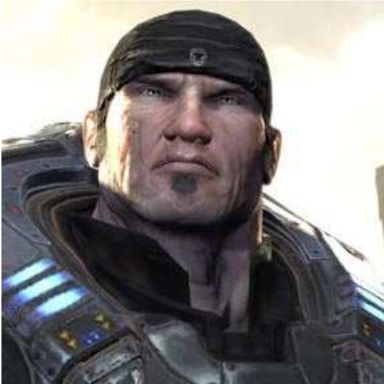
Figure 1: Character, Marcus Fenix