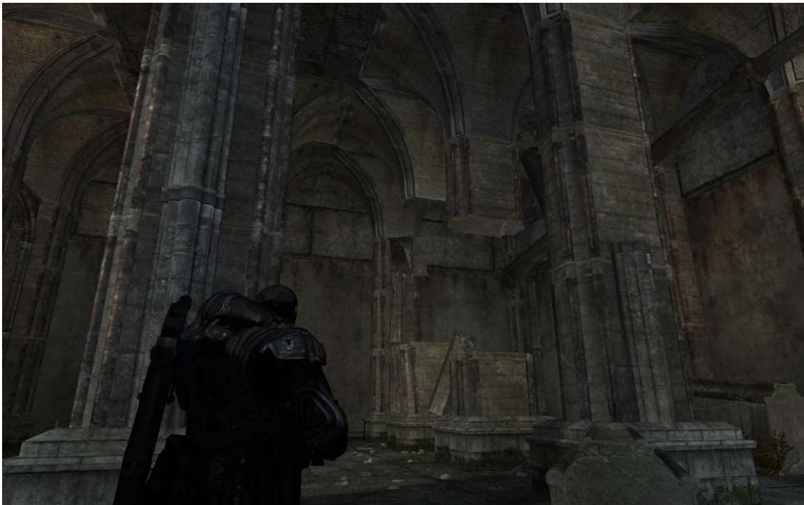
Figure 6: Models/Architecture, Columns and arches