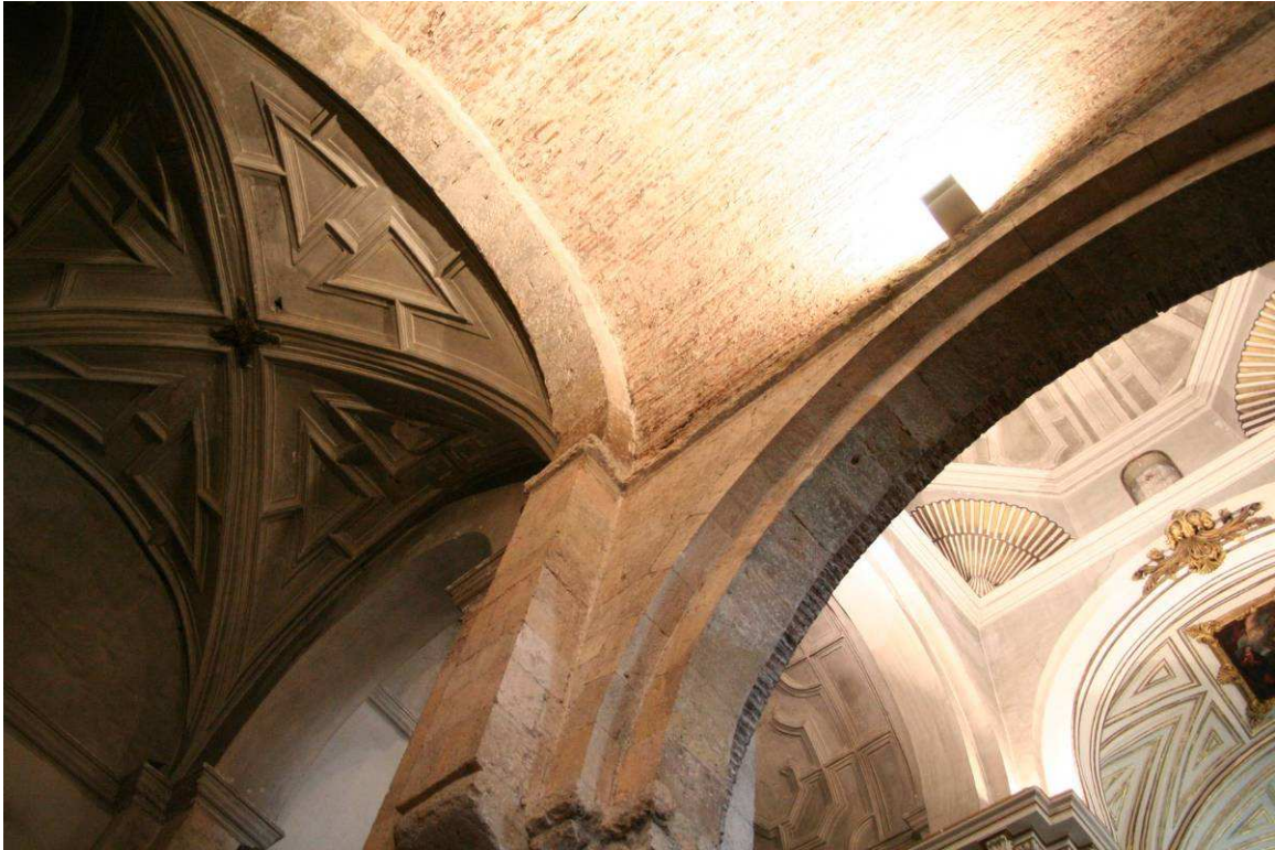
Figure 7: Models/Architecture, Column and arch