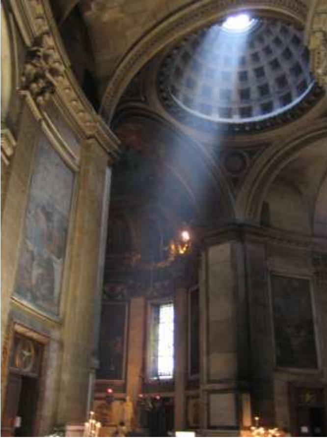
Figure 11: Lighting, Light stream