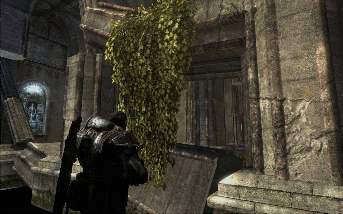
Figure 13: Texture, Overgrown vegetation