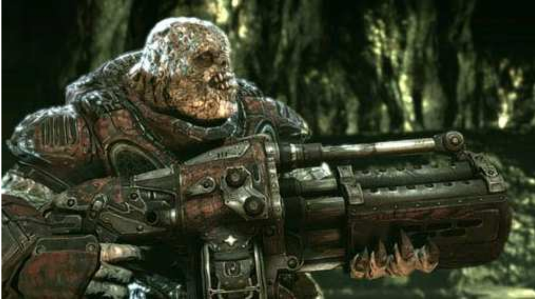
Figure 5: Enemy, Boomer