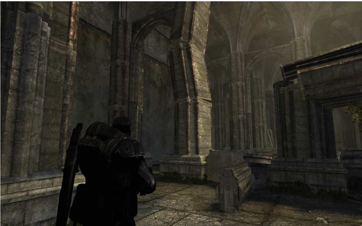
Figure 12: Lighting, Volumetric light