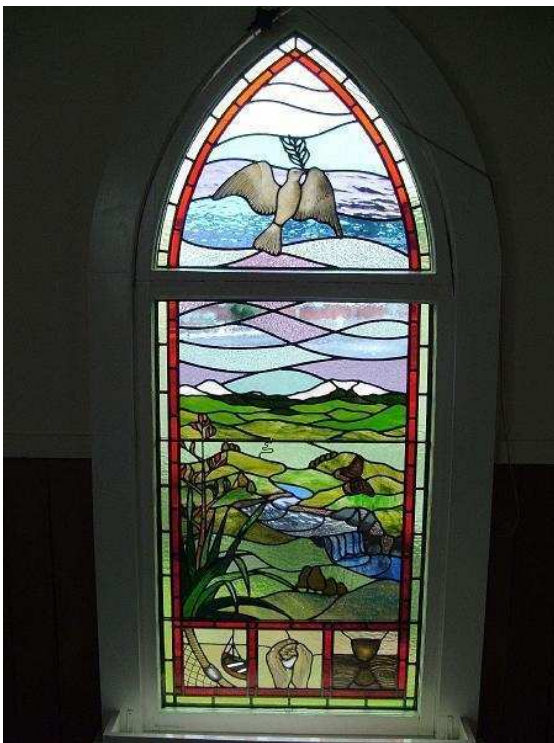
Figure 10: Texture/Lighting, Stained glass window