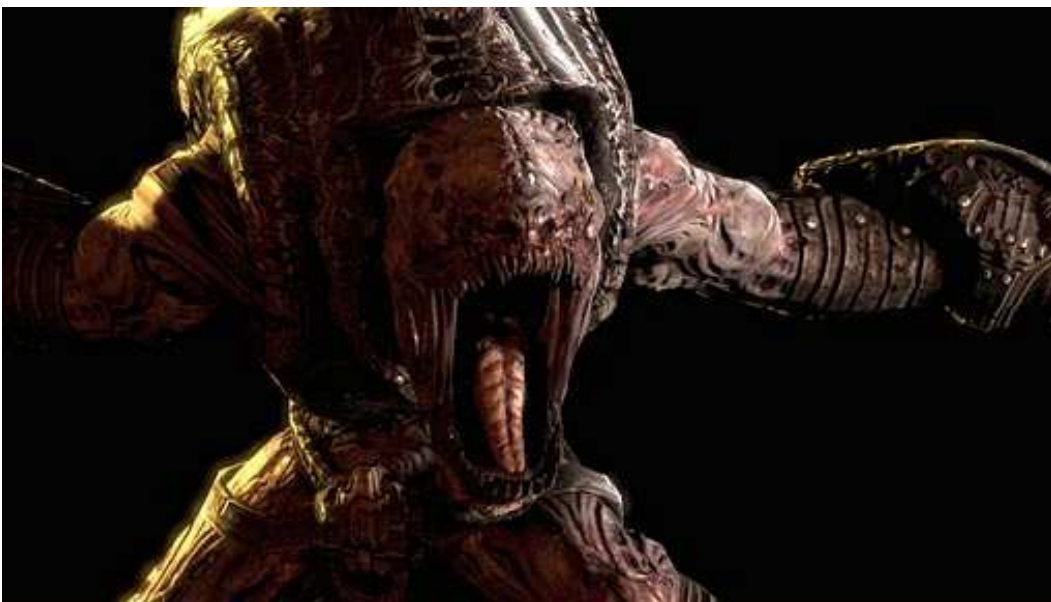
Figure 4: Enemy, Wretch